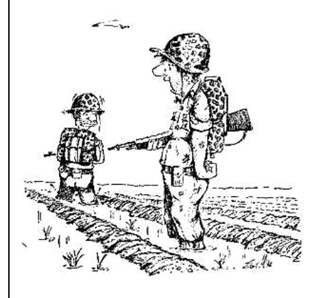
"Hey, Guffy, you notice any similarity between this stuff we're standin' in an' that Vietnamese beer we been drinkin'?"